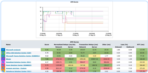
Real time monitoring

Alerts are customizable both in source and content. Determine which events trigger alerts, who receives them, and what information is distributed.