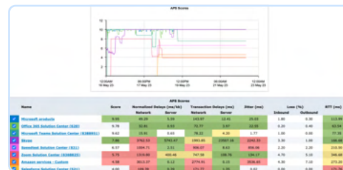
Real time monitoring

ClearView provides an in-depth analysis of network traffic, revealing used applications and connections between both internal and external hosts. A key advantage is the ability to recognize and categorize traffic without the need for decryption, safeguarding the integrity and security of your data.